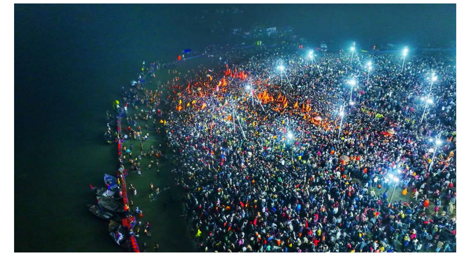
This Mahakumbh in Prayagraj is a subject of study for modern management professionals, planning, and policy experts. Nowhere in the world is there any parallel or example of this scale.

The world watched in wonder how crores of people gathered at Prayagraj at the banks of the confluence of rivers. These people had no formal invitations, no prior communication on when to go. Yet crores of people left for the Mahakumbh of their own accord and felt the bliss of taking a dip in the sacred waters.