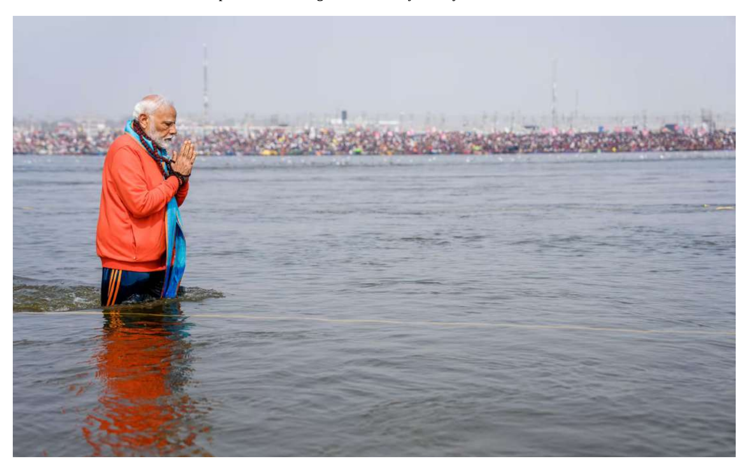
What has happened in the last few weeks is unprecedented and has laid a foundation for centuries to come.

The number of people who arrived in Prayagraj for this Mahakumbh has undoubtedly created new records. But beyond those physically present, crores of people who could not reach Prayagraj were also deeply connected emotionally to the occasion. The sacred water brought back by pilgrims became a source of spiritual bliss for millions. Many of those returning from the Mahakumbh were received with respect in their villages, honoured by society.